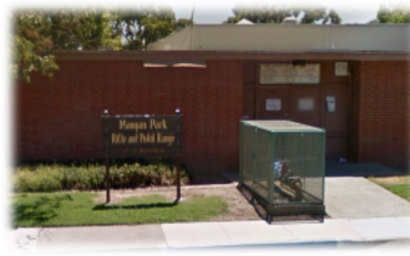
Mangan Gun Range

building through encapsulation and tarping of the roof, and following a work plan to ensure no lead dust migrates outside the building.