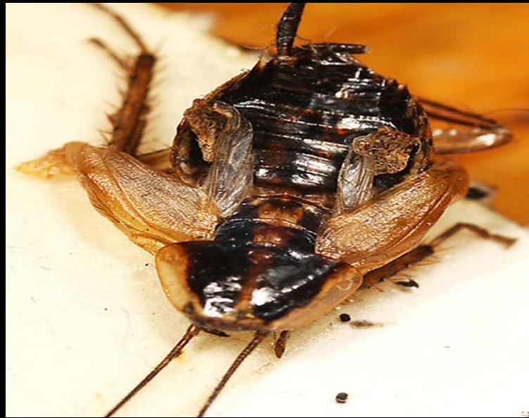
IGR affected German Cockroach