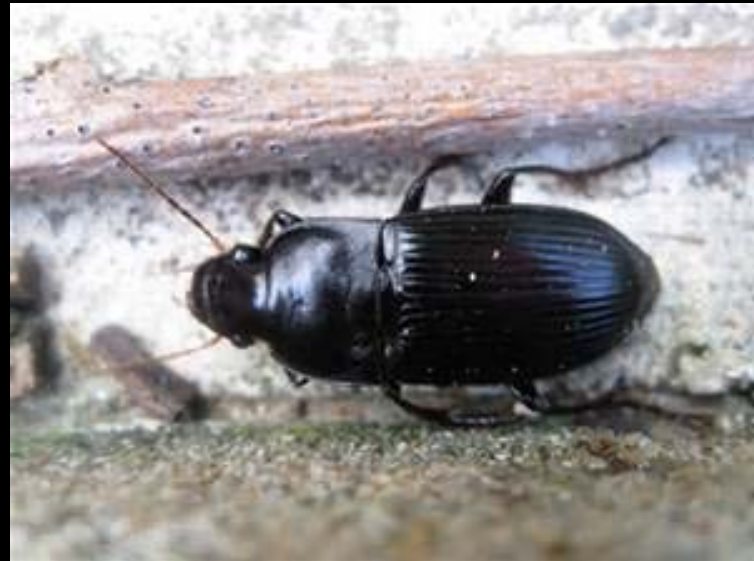
Common Black Beetle